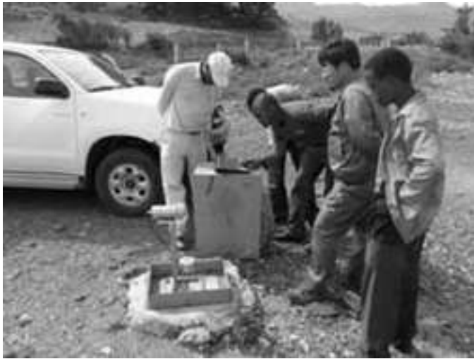
Monitoring data collection from borehole extensometer, 21 June, 2011