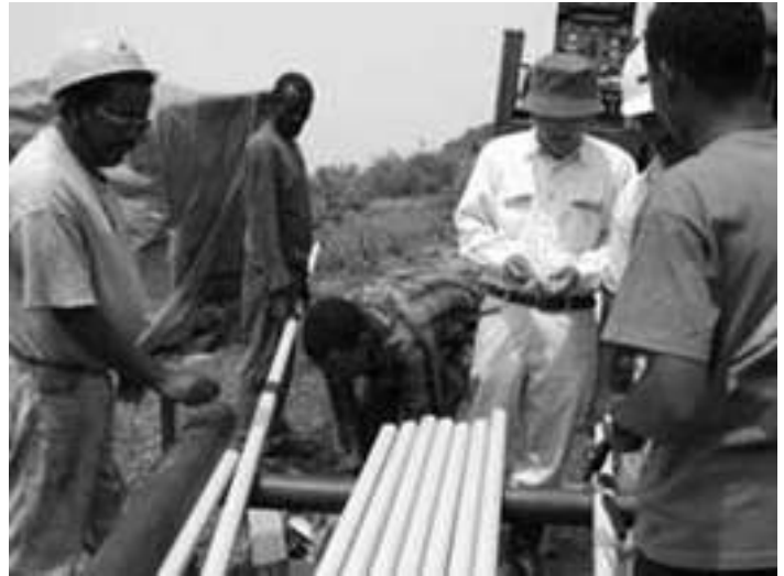
know-how transfer for connecting casing pipe for inclinometer, 13 July, 2011